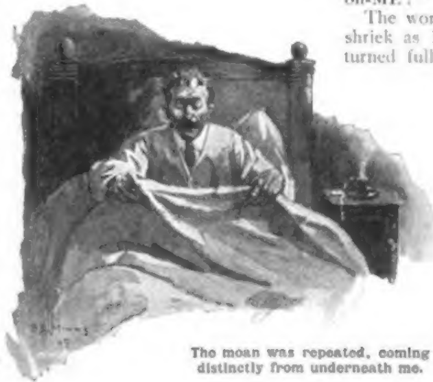
The moan was repeated, coming distinctly from underneath me.

At her own request, I described to her at